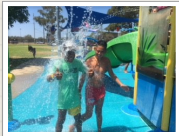
FUN UNDER THE BUCKET