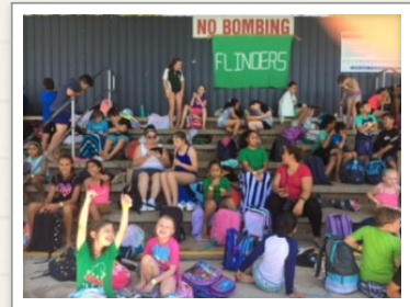
FLINDERS SUPPORTING THEIR SWIMMERS