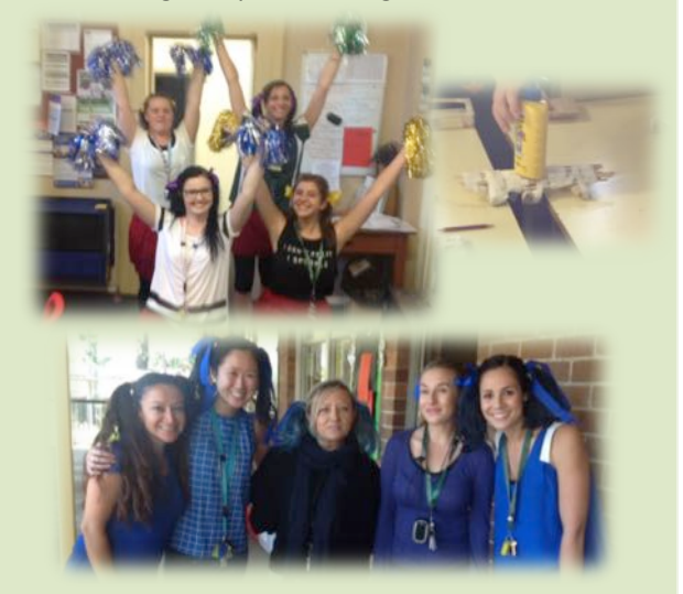
By Adeeba, Harrison and Tanaya

On Fun Friday, Stage 2 teachers have begun completing STEAM activities related to that letter. Building bridges during B week and constructing catapults during C week.