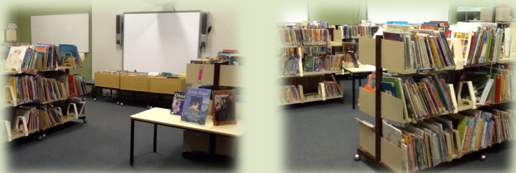
Leanne and Zoe

Next door to the book room will be a new reading room in which students will be able to learn the love of reading. Stay tuned for the new library name and look!